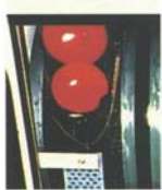
View of balls entering cleaning brushes