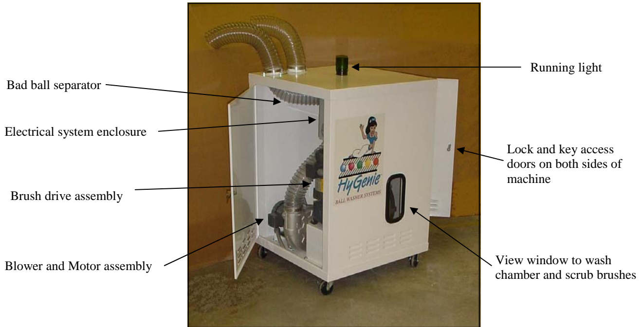
SHOWN WITH FLEXLINE AIR CONVEYANCE