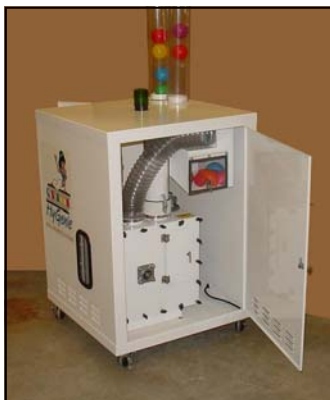
Right side interior view, showing Bad ball separator and Wash chamber