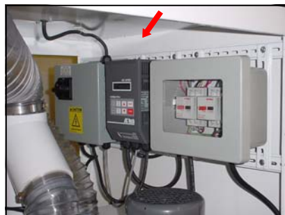
Factory installed cycle inverter required only for 50 hertz countries